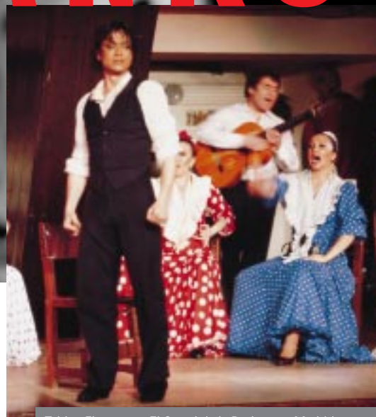
Tablao Flamenco "El Corral de la Pacheca", Madrid