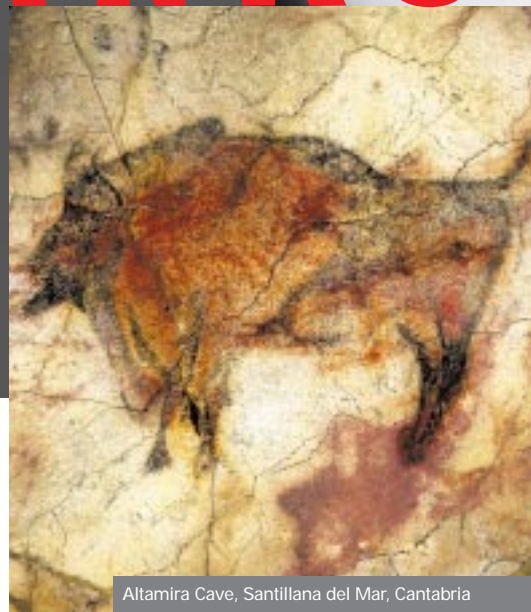
Altamira Cave, Santillana del Mar, Cantabria