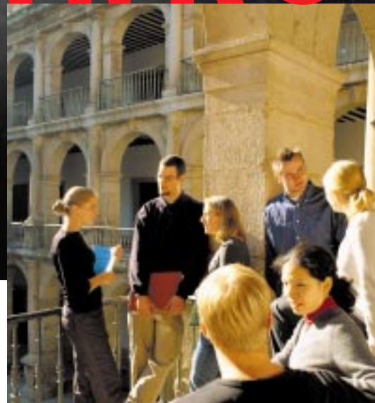
Students at Alcalá de Henares University, Madrid