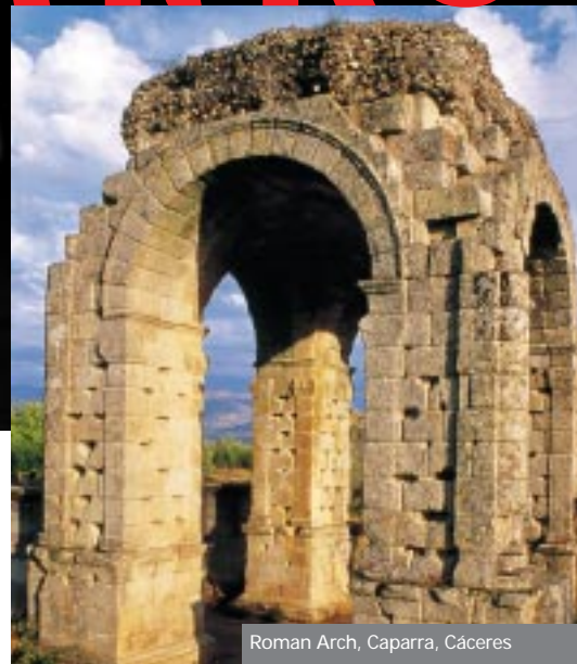
Roman Arch, Caparra, Cáceres