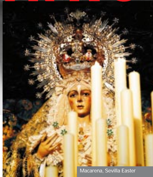
Macarena, Sevilla Easter