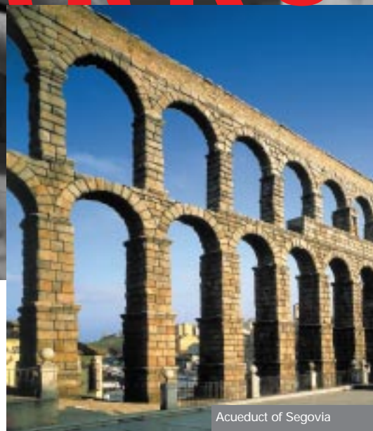
Acueduct of Segovia