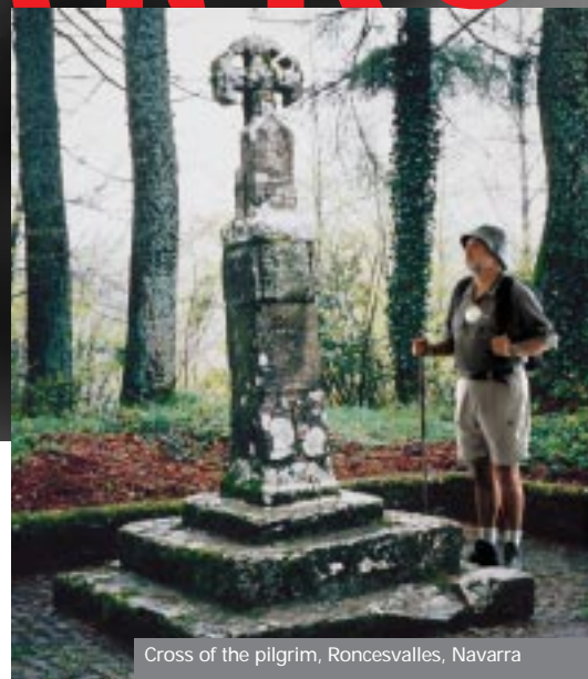
Cross of the pilgrim, Roncesvalles, Navarra